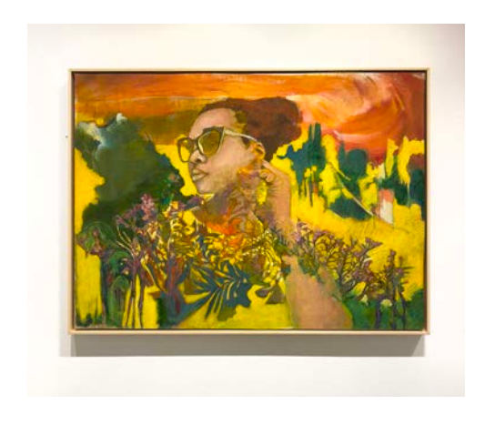
Michael Massenburg Cali Flower Painting and drawing 36" x 46" 2022