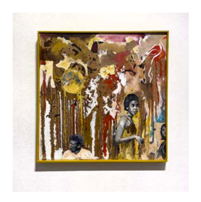
Michael Massenburg Three Views Collage and painting 24" x 24" 2015