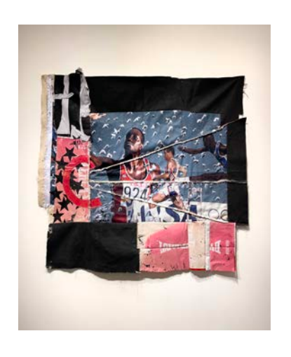
Cass Everage Untitled, Propaganda Quilt Repurposed fabric 5.8 ft x 4.7 ft 2023