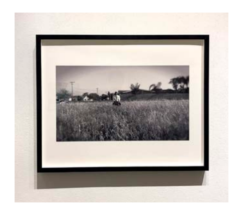
Donel Williams Job Interview Still image from video performance 25" x 32" 2015