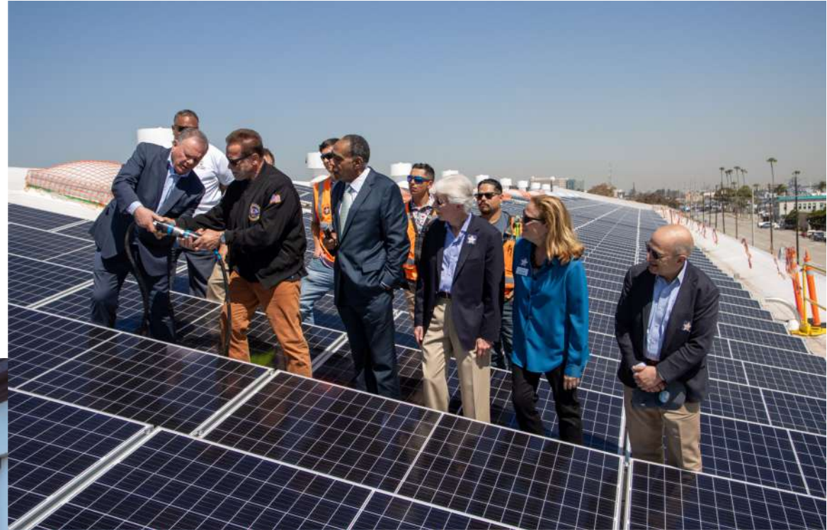
Governor Arnold Schwarzenegger Dedicating 2.2mw Solar on Berth 58-60 (April 2023)