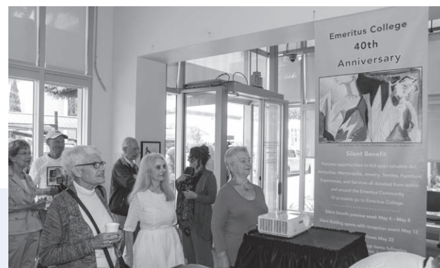
2015 40th Anniversary Event