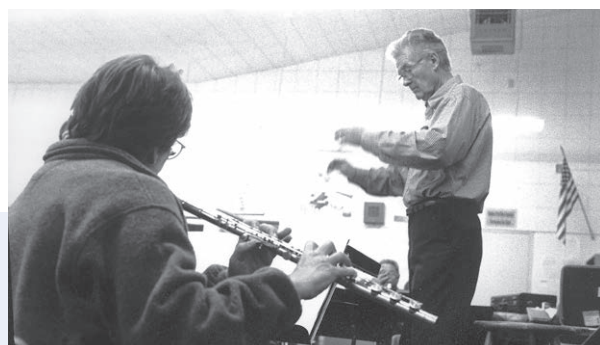
1999 Emeritus Concert Band