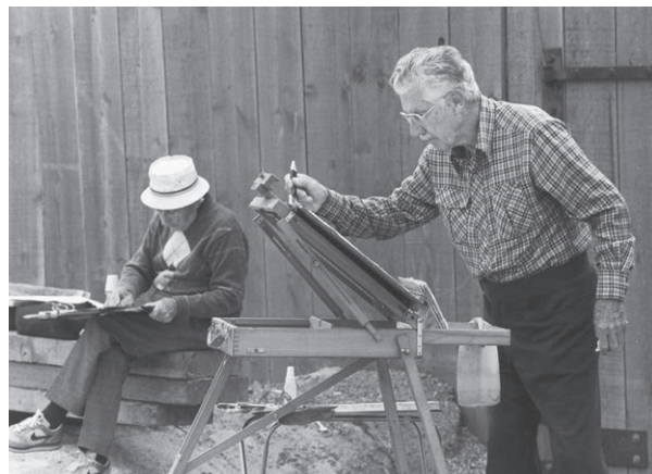
1992 Emeritus Watercolor Class