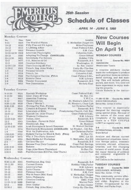
1980 Emeritus Schedule