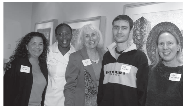
2008 Club 250 Reception