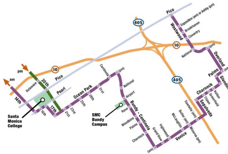
City of Santa Monica Big Blue Bus SMC Main Campus-SMC Bundy Campus-Mar Vista-Palms Route

The FEIR includes the addition of Related Project No. 119, Big Blue Bus – New Bus Line, a City of Santa Monica project which would provide expanded public transit service from the Palms and Mar Vista areas to the SMC Main Campus, passing by and stopping near the Bundy Campus. This service began February 5, 2007. There is no cost to SMC students to use this commuter line as funding is being provided by Santa Monica College. The figure below shows the bus route.